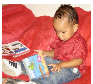
You are never too young to read!

SATURDAY STORY HOUR EVERY SATURDAY! CALL (671) 475-4751 or 475-4752 SEE YOU AT YOUR LIBRARY!!!